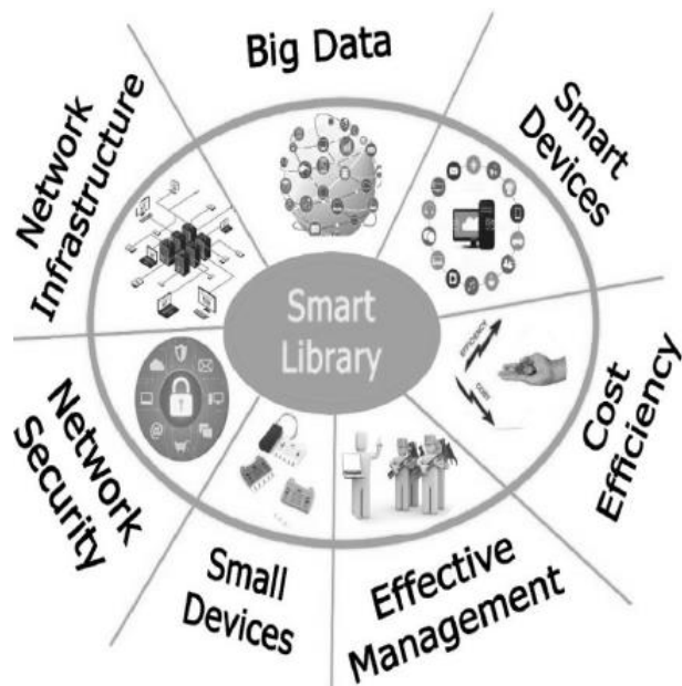
Figure 1: Smart Library

Big data can facilitate organisation of large volumes of research data and make it possible for integration with the smart library using the IoT technology for sharing with stakeholders (Garoufallou & Gaitanou, 2021). With big data management, librarians can be able to analyse, systematically extract research data and reports and share for research and development (Tella, 2020a). On the other hand, blockchain technology provides a crucial means of sharing information which can be organised in blocks and verified by experts and be added into the sharing chain within the networked infrastructure. This technology has similarly found its way in modern libraries and librarians where research data management can be established in blocks with respect to its contribution or function in R&D. Each of these blocks of data is secured and bound to each other using cryptographic or chain principles (Chingath & Babu, 2020).