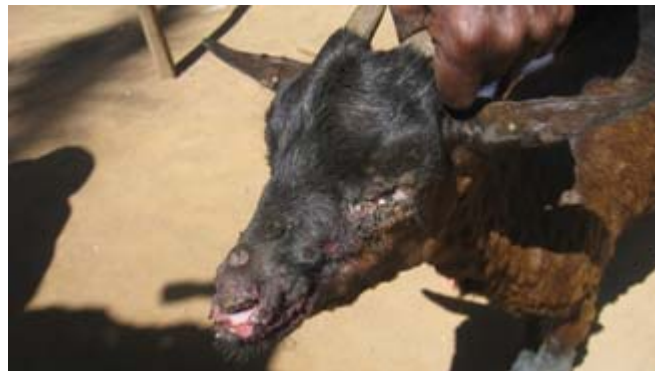
Figure 2. Severe ulcers on nostril and lips, eyelids matting and nodular skin lesions in goat.

Clinical presentation, glossy and histopathological features, serological and molecular findings suggest that the disease outbreak in southern Tanzania was due to PPR (Muse et al. , 2012a, b). The first case was reported in Likuna village, and Mahuta and Ngunja villages had the highest PPR seroprevalence (Fig. 1). Clinical signs observed in sick animals included: high fever (41°C), depression, anorexia, purulent lacrimation, reddening of conjunctiva, matting of the eyelids and nodules all over the body. The source of the infection and spread of PPR was introduction of new animals and contact during communal grazing and housing. The disease shows capability of PPR to move quickly across long distance and large areas due to quick movement of small animals. Small ruminants in southern Tanzania and SADC countries are at high risk from PPR.